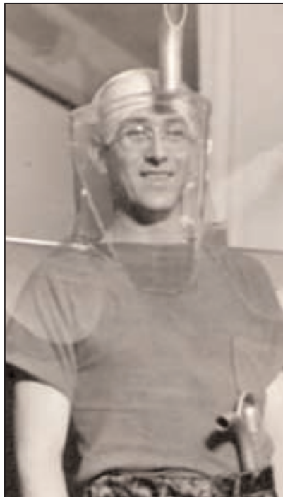
Junior Space Ranger